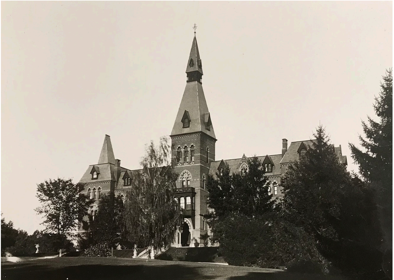
Figure 2: Sage College West Facade, n.d., Kroch Archives..

own management, the students of Sage instead formed the Women's Self-Government Association, so were able to retain a degree of autonomy from the University.