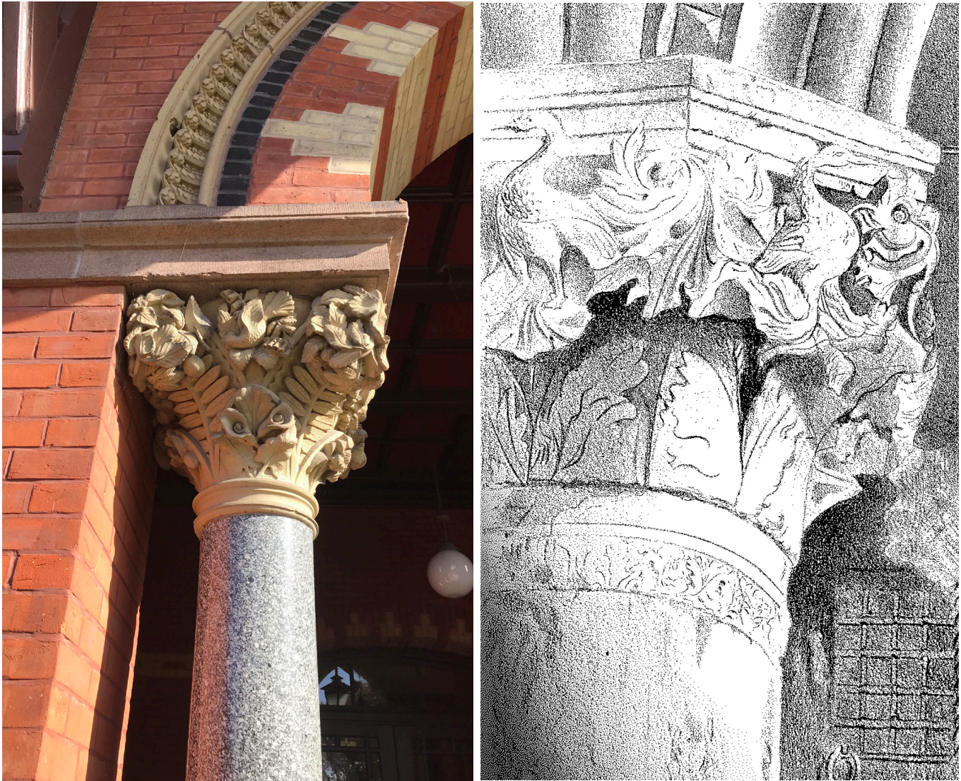
Figure 3: Comparison of Sage College column with John Ruskin, "Capital from the Lower Arcade of the Doge's Palace, Venice," Plate V, Seven Lamps of Architecture

White's framing of Sage Hall, had been replaced with a duty to represent the University on some imagined, national stage.